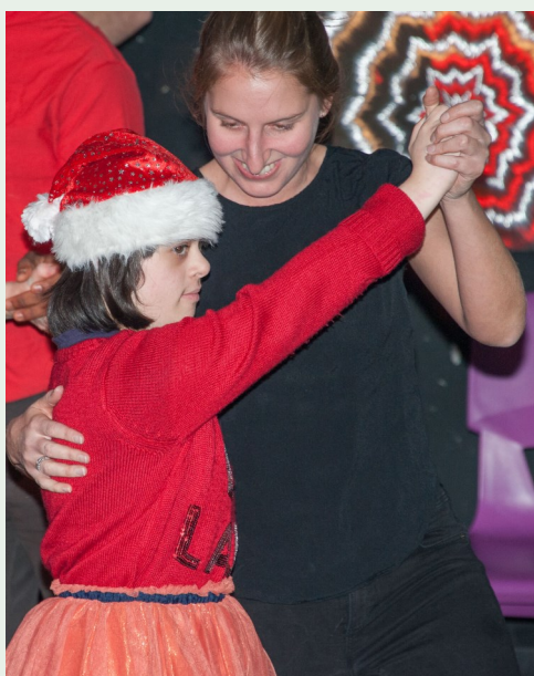
Class 8 were jiving the night away!