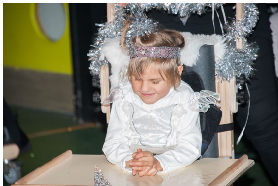
Class 1 were shining stars!