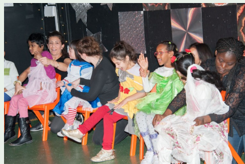
Class 5 danced the can– can!

With ballroom, latin and jive; songs from musicals and the theatre it was a really special event. The judges agreed that everyone had done an amazing job!