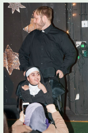
Class 7 rocked it to Sister Act